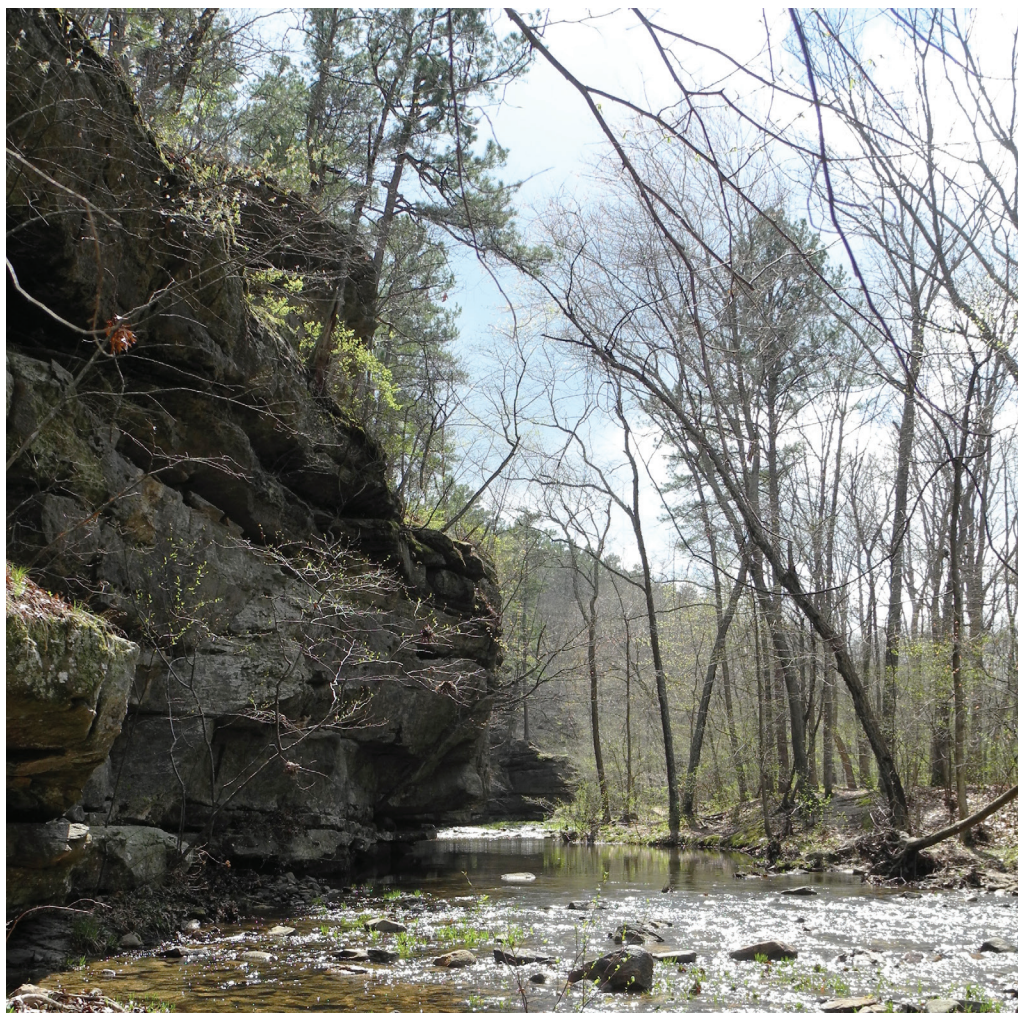
Hawn State Park.