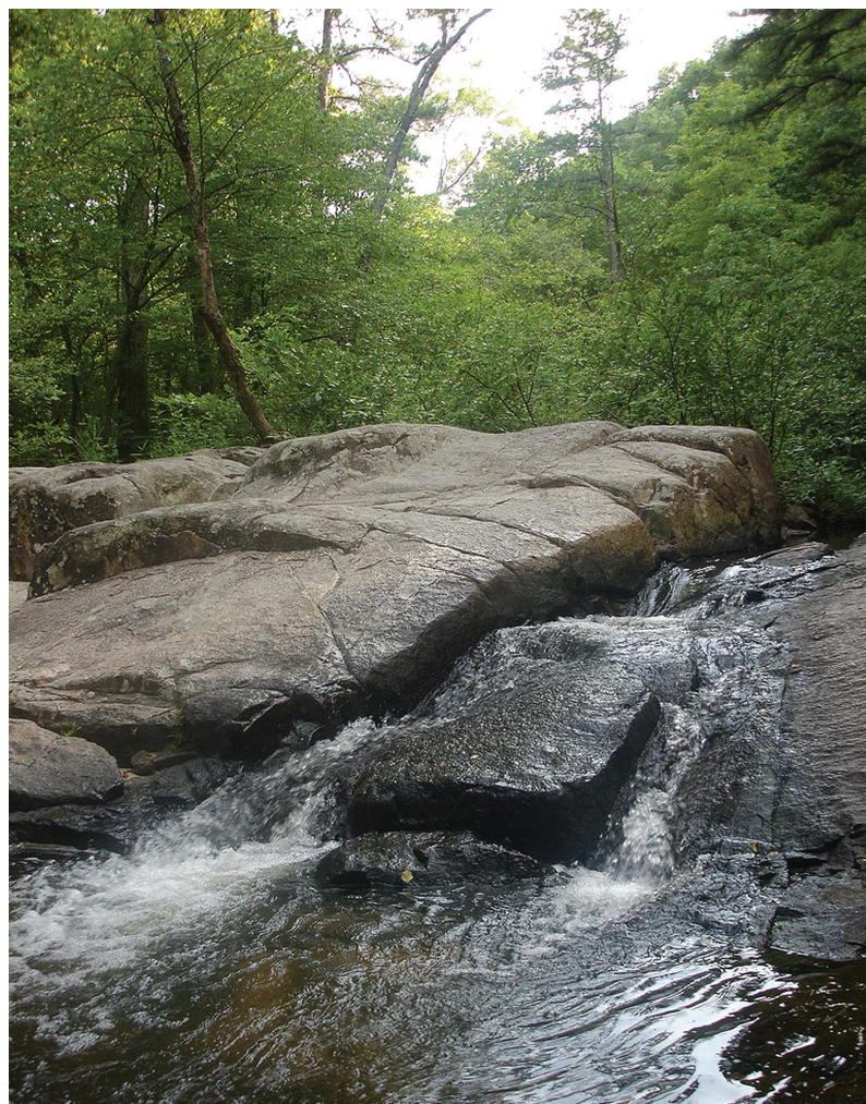
Pickle Creek at Hawn State Park.

The trail climbs to an overlook atop a bare knob enclosed by scraggly pines and lowbush blueberries. Beneath the ledge, shattered boulders form a jumbled escarpment to the forest below. We perch together, waiting out the hikers filing past. Again, no other same-sex pairs.