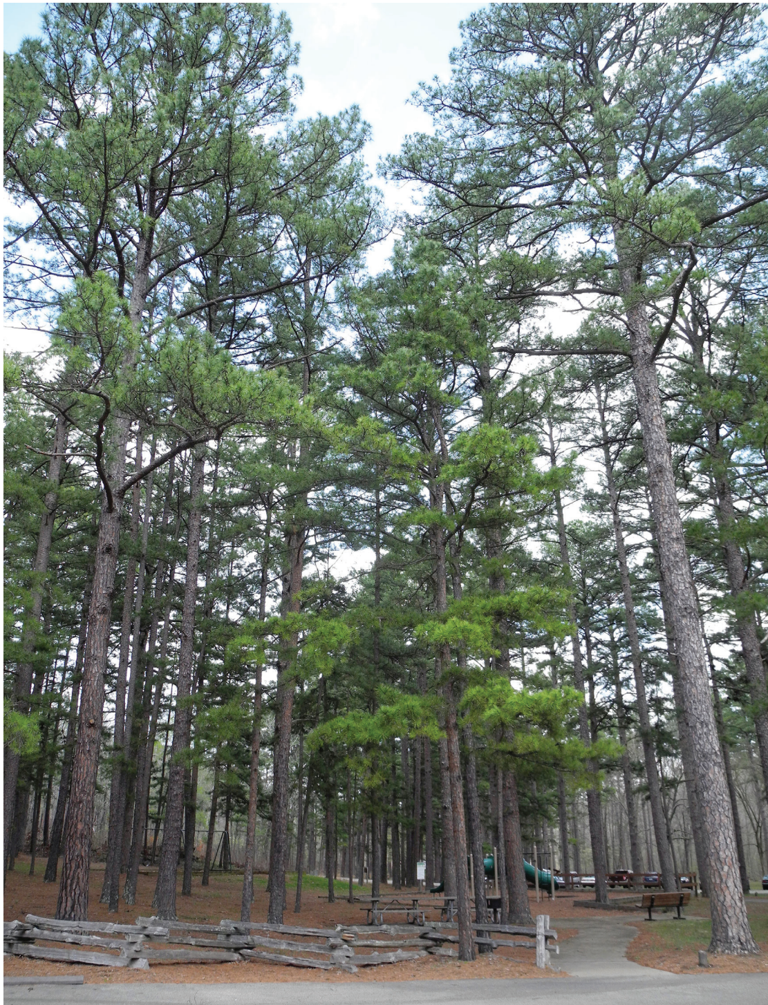
Shortleaf pines at Hawn State Park.

We amble through a pine savanna to the trailhead. Delicate grasses carpet the forest floor. A breeze whispers through the wide-spaced shortleaf pines piercing the sky. The sandy pine-needled pathway cushions our footsteps.